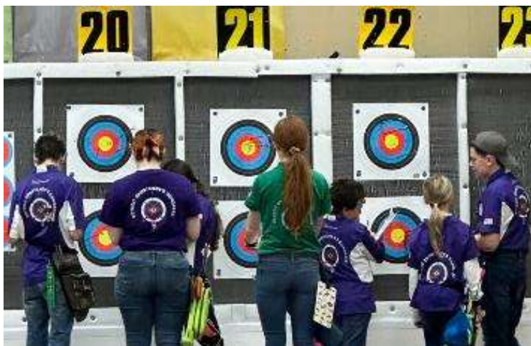
DSC junior archers scoring their targets