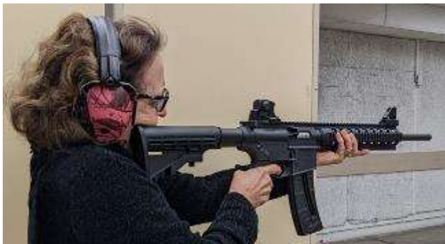
A Toys for Tots Shoot competitor aims her .22 rifle at the turkey target during the 17 th annual charity shoot Nov. 29, 2022.